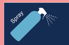
2. Spray on surface