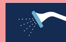
4. Rinse off