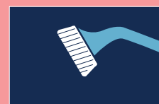
3. Brush heavily soiled rims